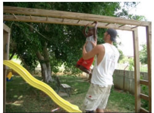
A helping hand is always appreciated!

Check out more pictures at www.jaminjamaica.com