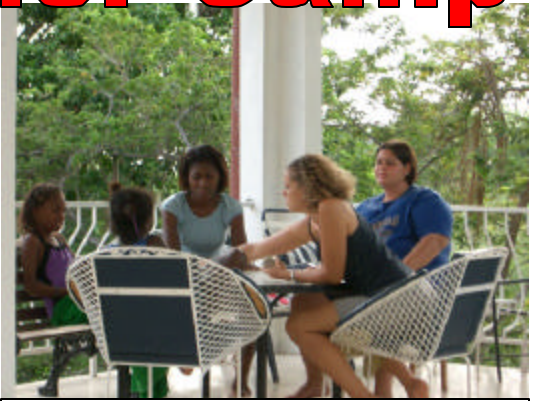
Board games are a favorite pass time.