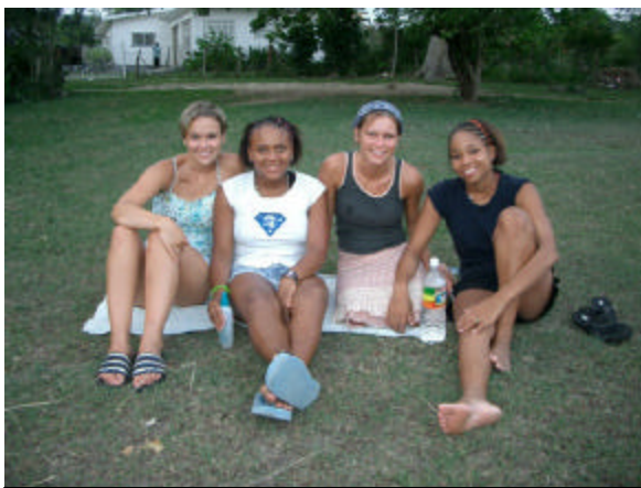
Team members become great friends to our children. Thanks to email, these relationships often continue long term!