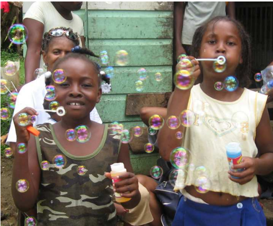
A bubbling good time was had by all in Petersville while this team visited.